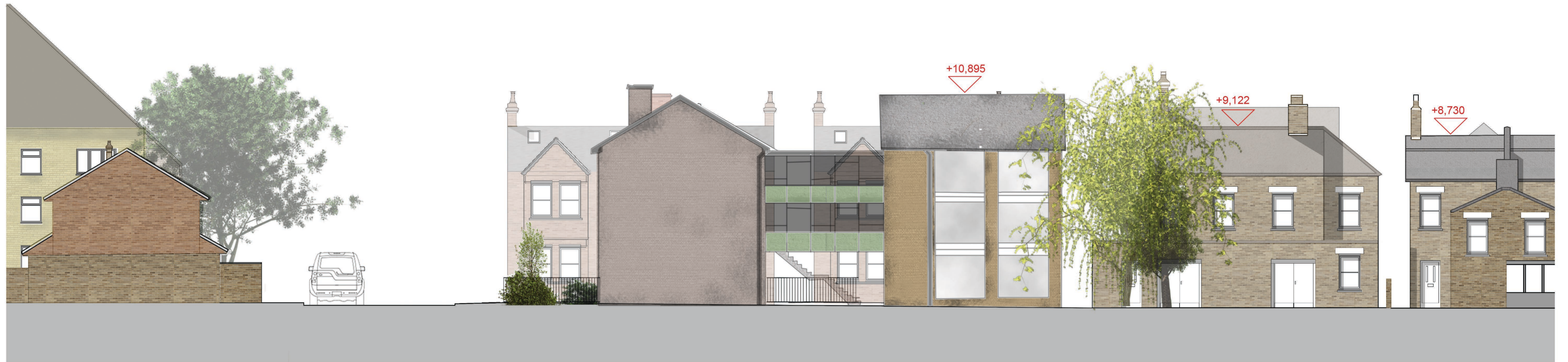
Existing Elevation Montague Road Extent of Application