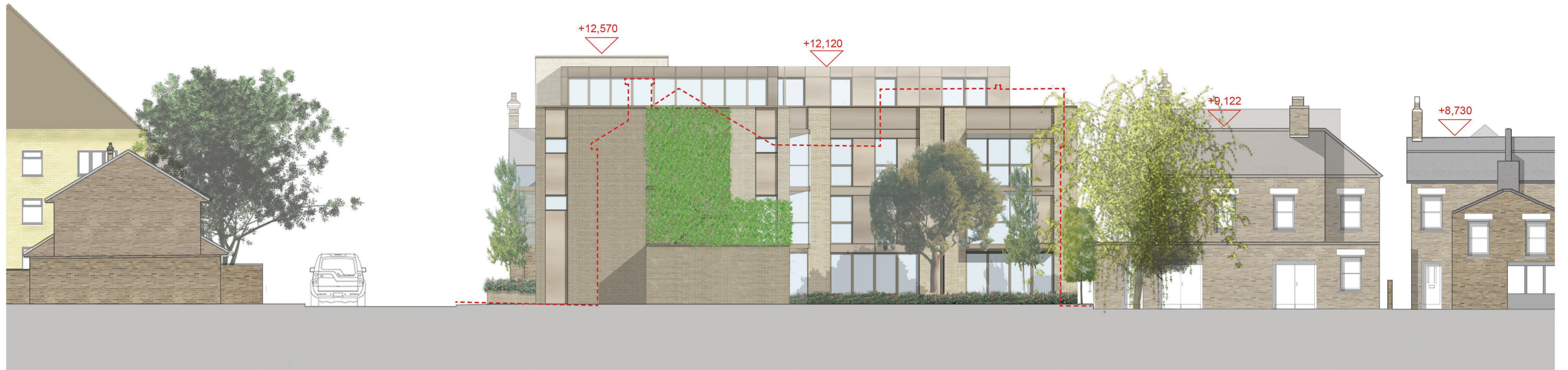
Proposed Elevation Montague Road Extent of Application